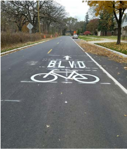
Arden Avenue, completed in 2017.