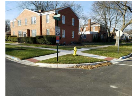
Sidewalks and ADA ramps may be completed as part of the project.

Garbage collection will typically not be affected. However, notice will be given to all affected residents if any changes in service are necessary once work begins.